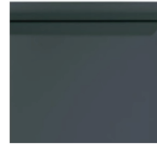
#57 THUNDER GRAY