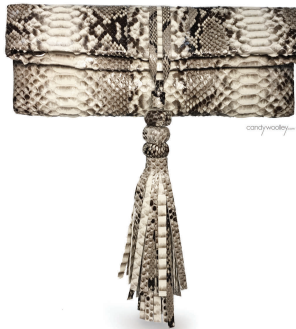
CANDY WOOLLEY ACCESSORIES