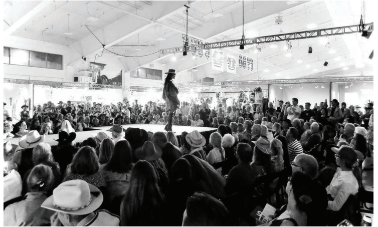
EXHIBIT + SALE

A gala celebration where the public views award winning craft, meets this year's artists, walks through the Designer Show House, experiences a Runway Fashion Show and participates in the live WDC Auction while enjoying local culinary creations + signature cocktails during a festive night of shopping.