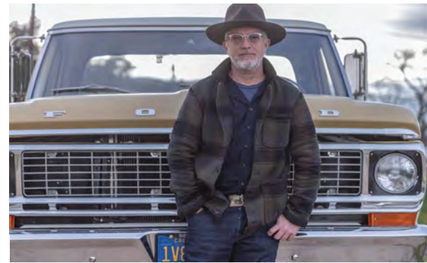
EXHIBIT + SALE