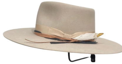
D. JAMES HATS