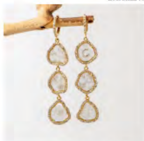
JILL DUZAN JEWELRY