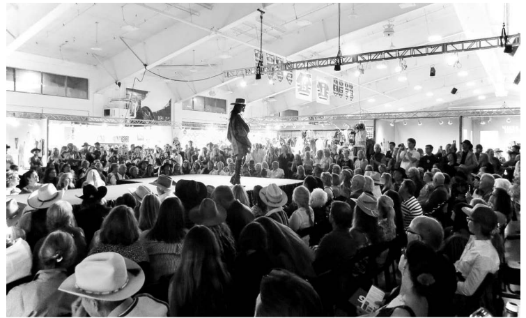
EXHIBIT + SALE

A gala celebration where the public views award winning craft, meets this year's artists, walks through the Designer Show House, experiences a Runway Fashion Show and participates in the live WDC Auction while enjoying local culinary creations + signature cocktails during a festive night of shopping.