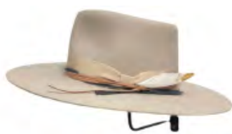
D. JAMES HATS