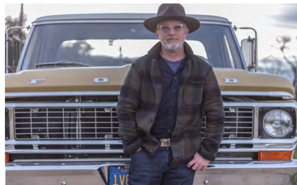
EXHIBIT + SALE