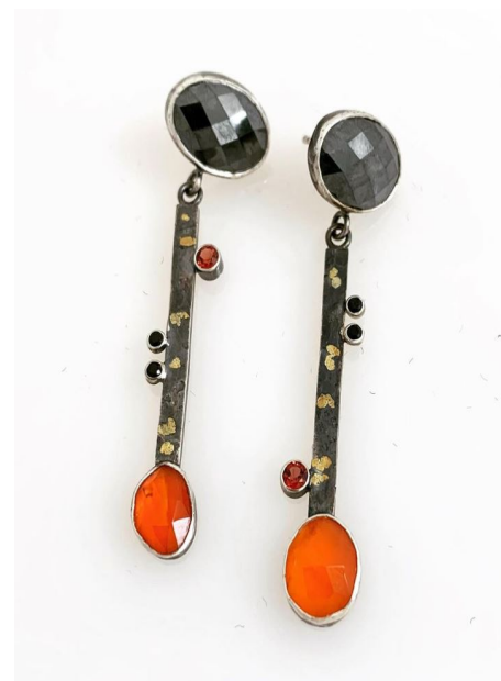
STEPHANIE ZIER JEWELRY