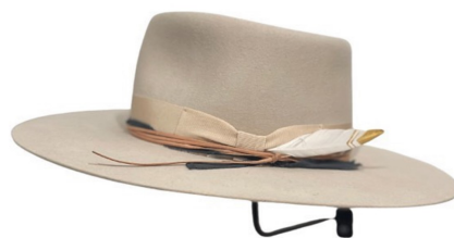
D. JAMES HATS