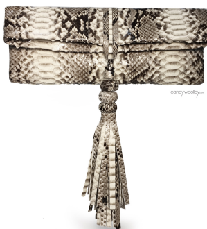
CANDY WOOLLEY ACCESSORIES