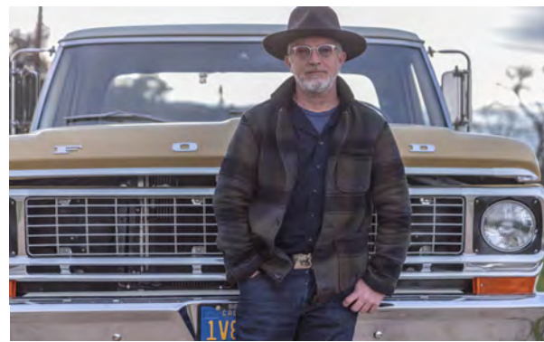
EXHIBIT + SALE