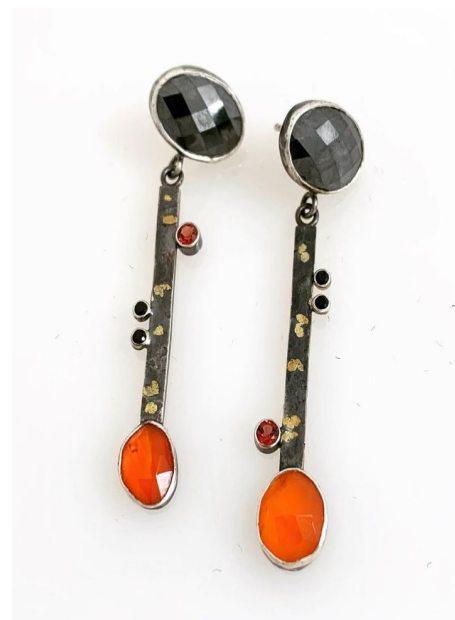
STEPHANIE ZIER JEWELRY