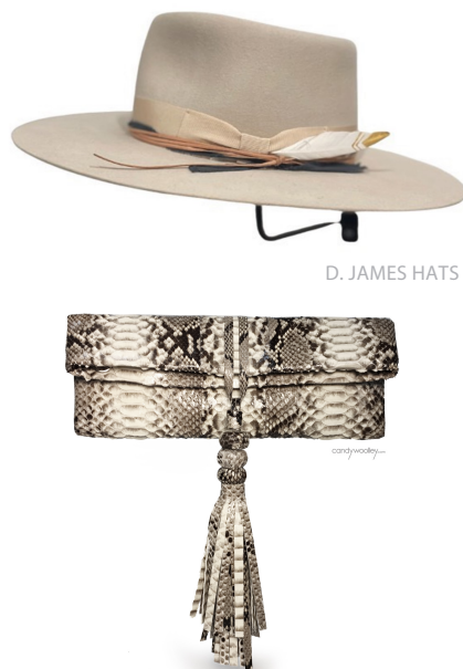
D. JAMES HATS