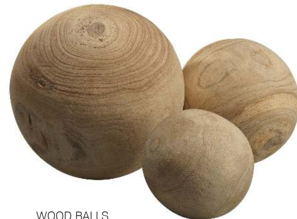
WOOD BALLS set of 3, attractive rough wood grain pattern makes these organic balls each one of a kind, natural