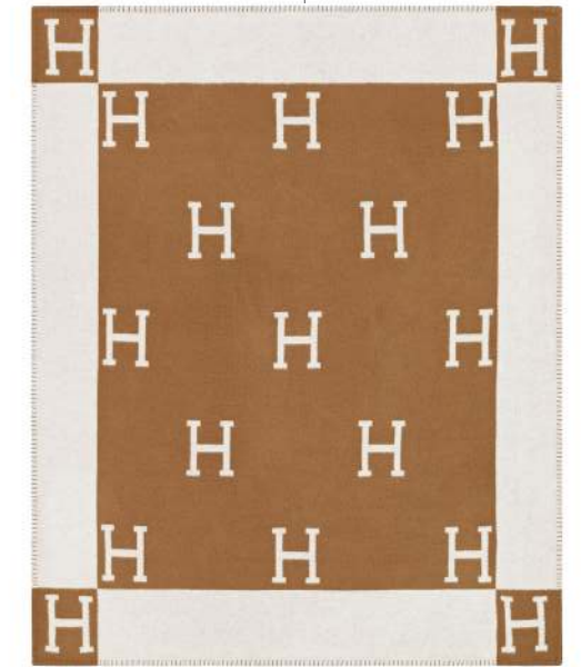
HERMES AVALON THROW BLANKET in ecru/camel, 90% merino wool, 10% cashmere

"A WELL DESIGNED INTERIOR IS AN INVESTMENT EXPRESSING OUR CORRELATION BETWEEN OUR ENVIRONMENT AND OUR PSYCHOLOGY," REFLECTS ANNE. A WARM, SERENE AND COMFORTABLE SPACE TRANSFORMS OUR EMOTIONAL WELL-BEING. HERE, SHE SHARES HER PICKS FOR COMBINING COLOR AND TEXTILES IN A SPACE.