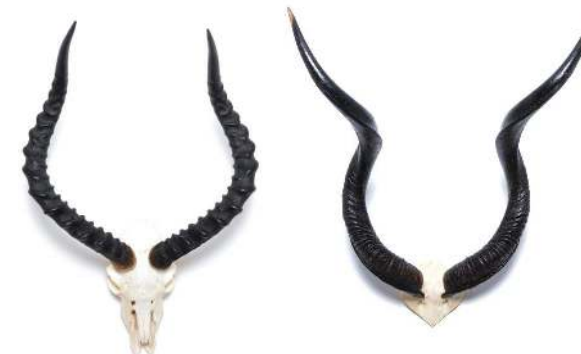
HORNS Kudu skull and horns, V-skull and horns