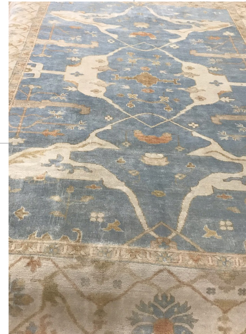
OUSHAK HAND KNOTTED WOOL RUG