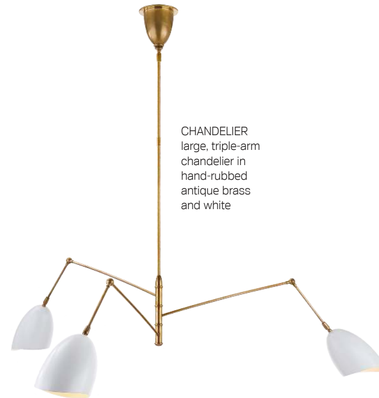
CHANDELIER large, triple-arm chandelier in hand-rubbed antique brass and white