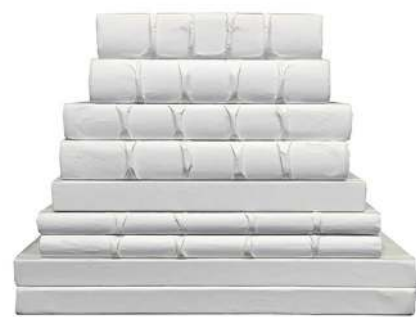
WHITE BOOKS 9 volume stack of white books