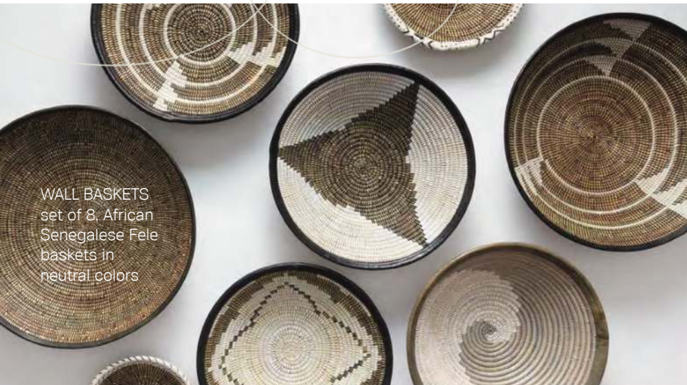
WALL BASKETS set of 8. African Senegalese Fele baskets in neutral colors