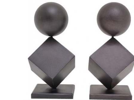
BOOKENDS crafted of aluminum in this architectural form, these bookends are functional and pieces of art.

For more information on these items visit www.anneburesh.com .